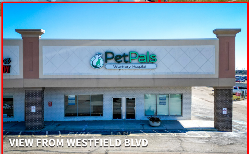
VIEW FROM WESTFIELD BLVD