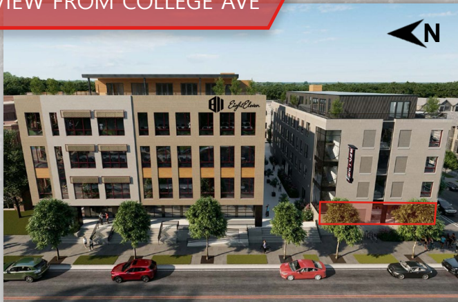
VIEW FROM COLLEGE AVE