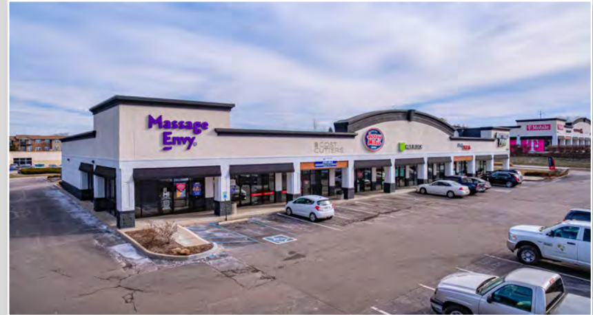
Emerson Commons II