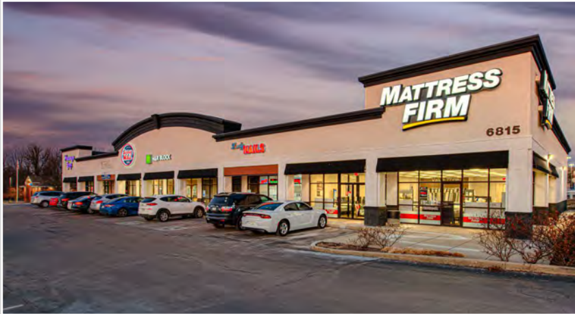
Emerson Commons I