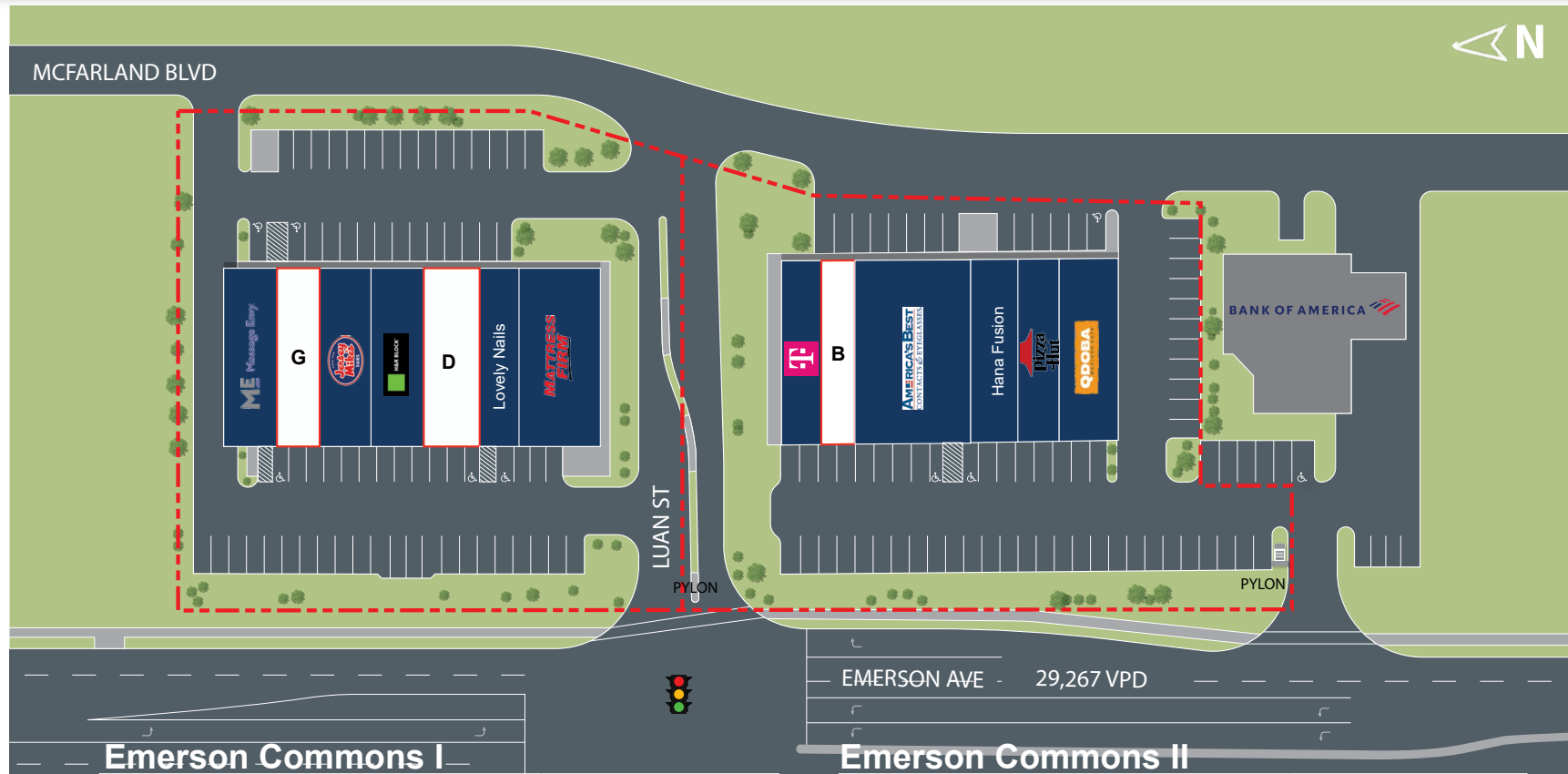
Emerson Commons I