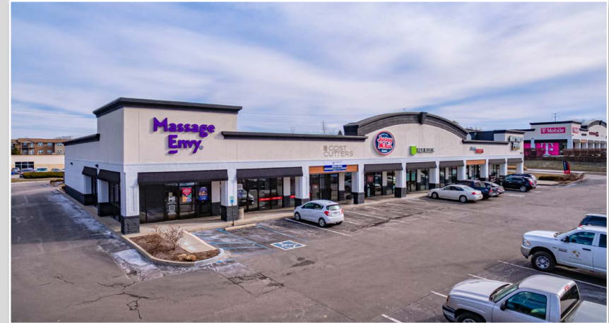
Emerson Commons II