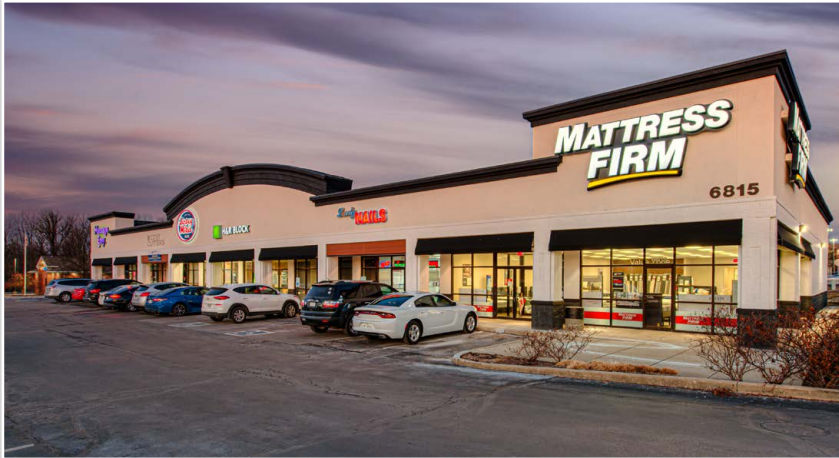
Emerson Commons I