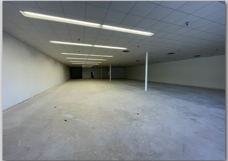
SUITE 6A - 6,500 SF