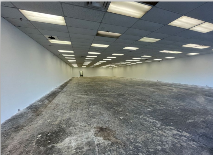
SUITE 9 - 7,500 SF