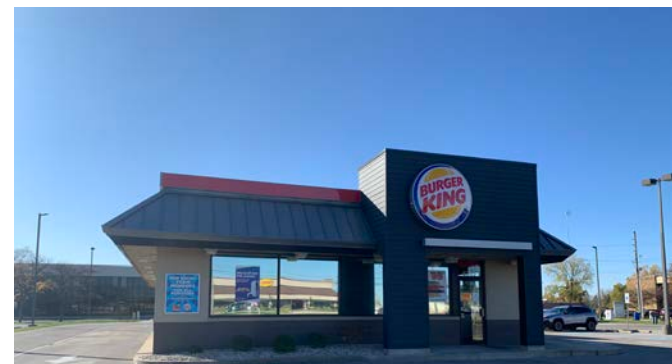
Freestanding Restaurant w Drive-Thru | Indianapolis, IN