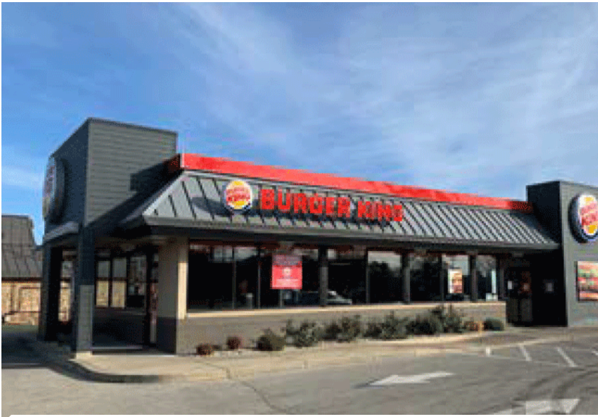
Freestanding Restaurant w Drive-Thru | Indianapolis, IN