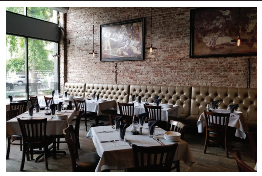
Main Level: Front Dining Area