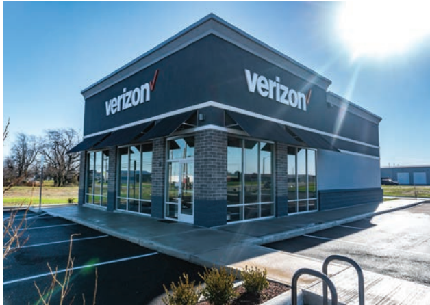
Now Open - December 2018