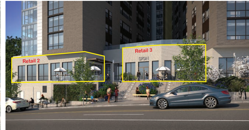
Facing South on State Street