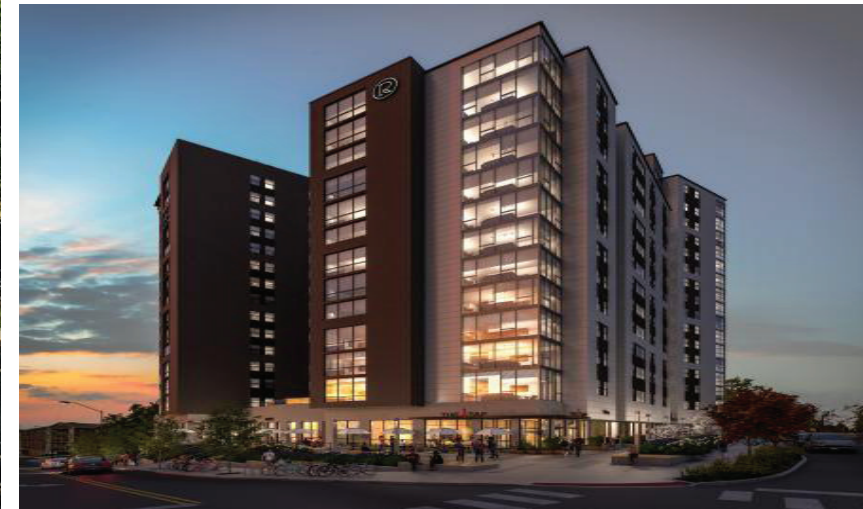
Facing Southeast Corner of State Street & Chauncey Avenue