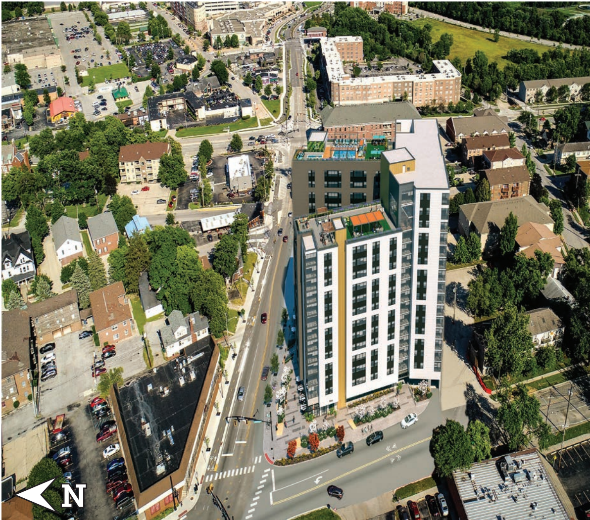
Facing East on State Street