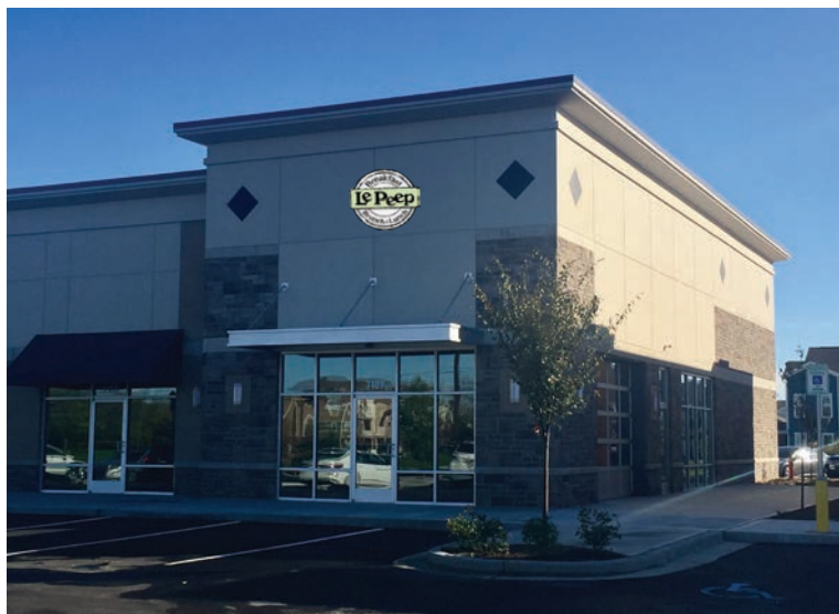
Western Endcap with Patio