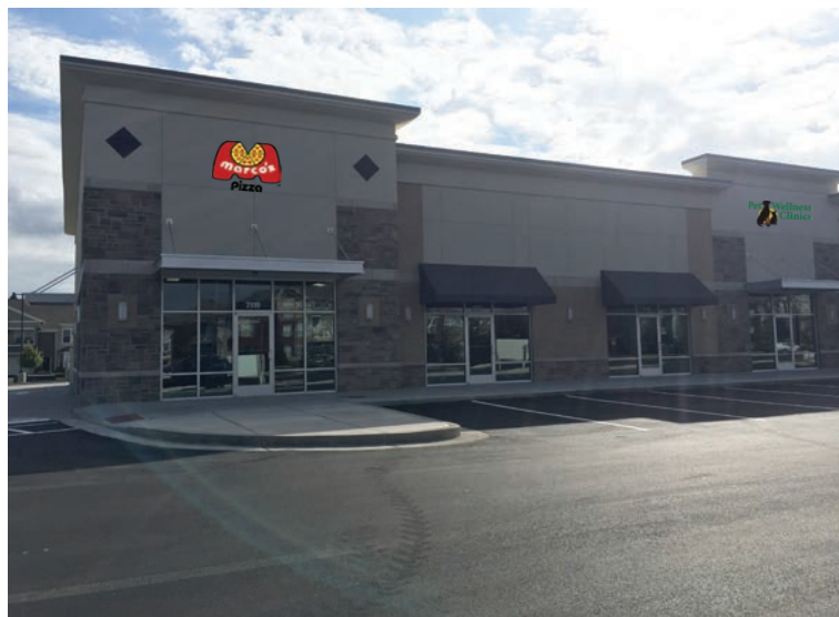
Eastern Endcap with Drive-Thru

Information within this brochure has been obtained from sources believed reliable, but we make no representations or warranties, expressed or implied, as to the accuracy of the information. Prospective tenant and tenant representatives must verify the information and bears all risk for any inaccuracies as it relates to property and market information.