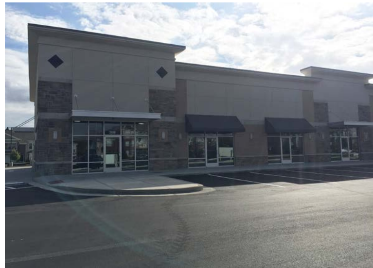
Eastern Endcap with Drive-Thru

Information within this brochure has been obtained from sources believed reliable, but we make no representations or warranties, expressed or implied, as to the accuracy of the information. Prospective tenant and tenant representatives must verify the information and bears all risk for any inaccuracies as it relates to property and market information.