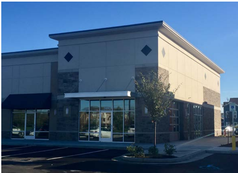
Western Endcap with Patio