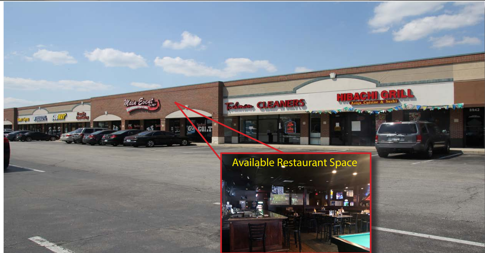
Available Restaurant Space

8922 East 96TH Street, Fishers, IN 46038