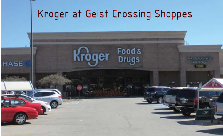
Kroger at Geist Crossing Shoppes

9737 Fall Creek Rd, Indianapolis, IN 46256