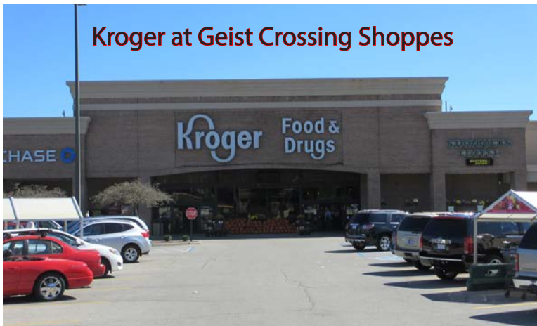
Kroger at Geist Crossing Shoppes

9737 Fall Creek Rd, Indianapolis, IN 46256