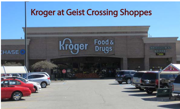
Kroger at Geist Crossing Shoppes

9737 Fall Creek Rd, Indianapolis, IN 46256