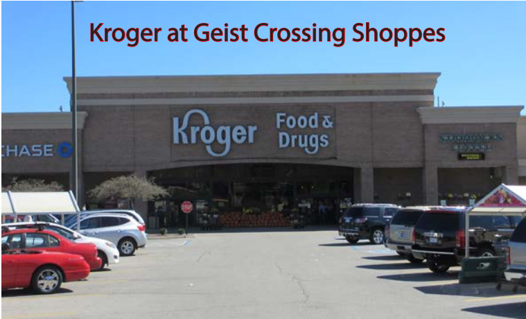
Kroger at Geist Crossing Shoppes

9737 Fall Creek Rd, Indianapolis, IN 46256