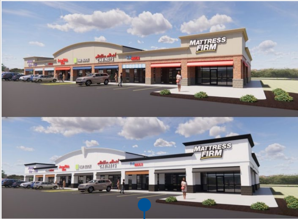
Existing Property - Emerson Commons I