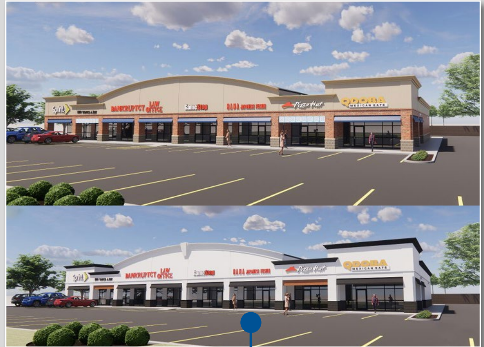
Existing Property - Emerson Commons II