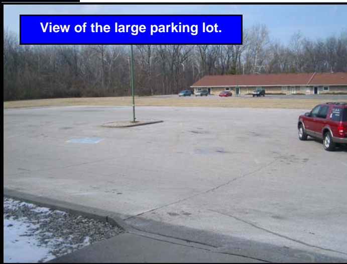
View of the large parking lot.