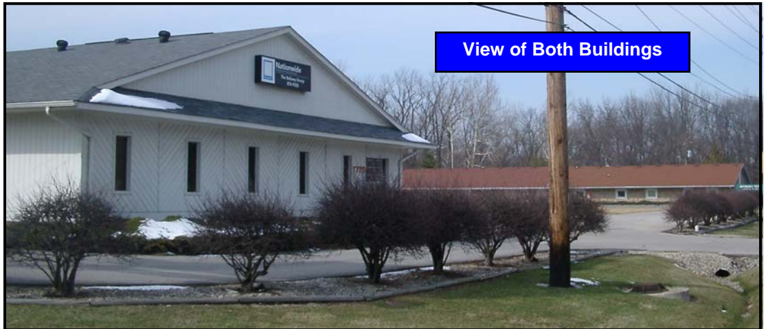
View of Both Buildings