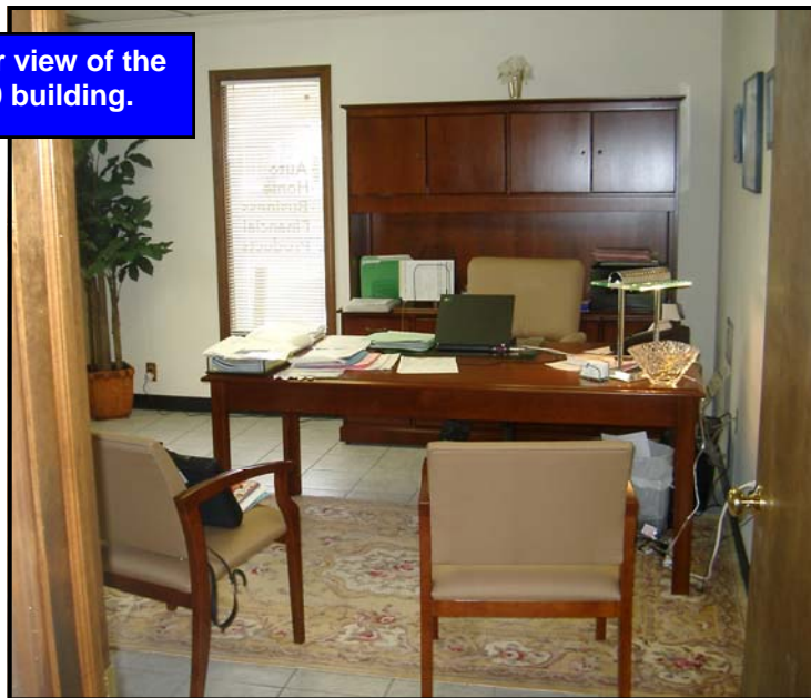
Interior view of the 7770 building.