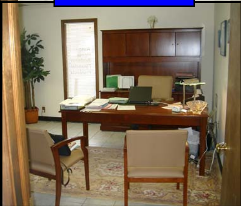
Interior view of the 7770 building.