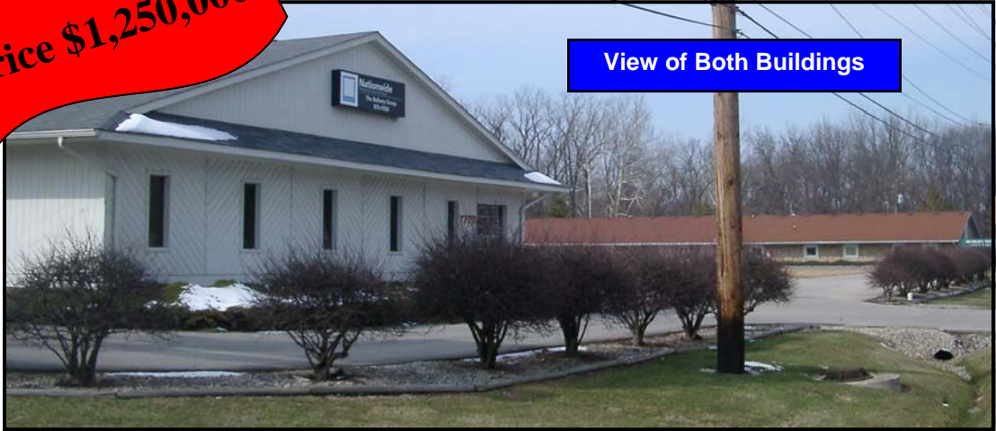
View of Both Buildings