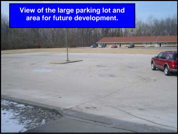
View of the large parking lot and area for future development.